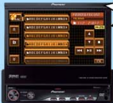
Pioneer AVH-P5000DVD 7" Motorized DVD Player