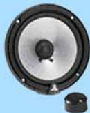
JL Audio TR-650CSI 6.5" Components