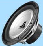
JL Audio 10W1V2 300W 10" Sub