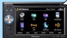
Pioneer AVIC-F700BT 6" Navigation w/ Bluetooth