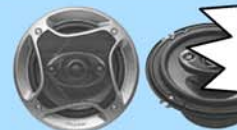
Pioneer TS-1682R 6.5" 4-Way Co-Ax