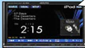
Alpine IVAD-W505 7" Motorized DVD Player